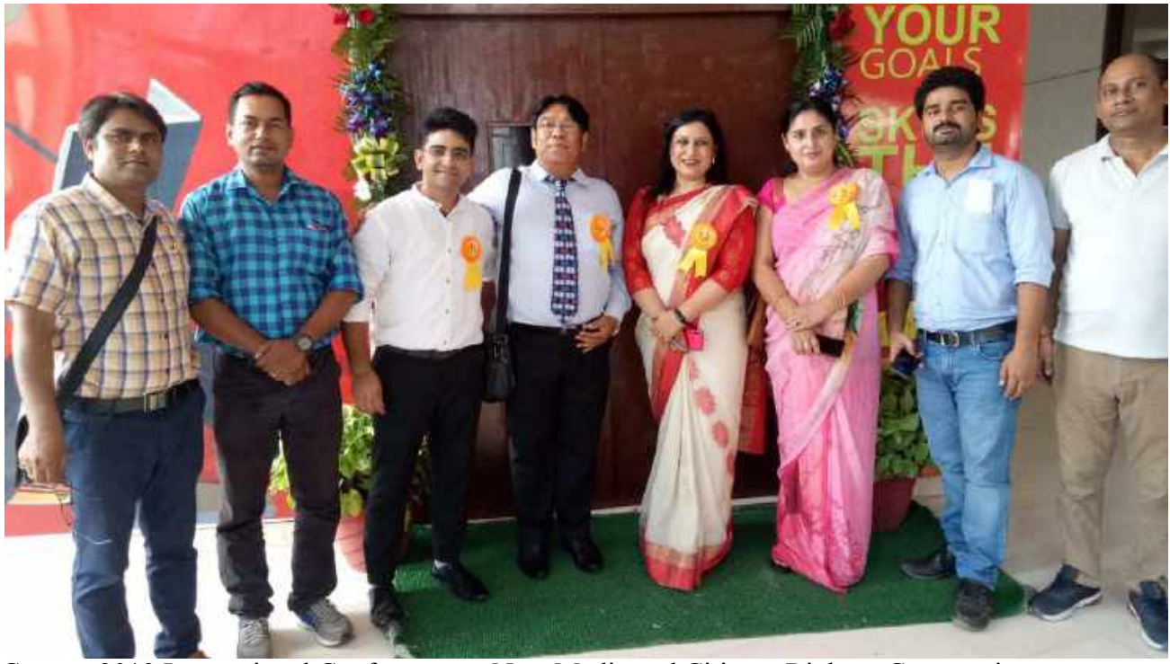
Comcon2019 International Conference on New Media and Citizens Right to Communicate