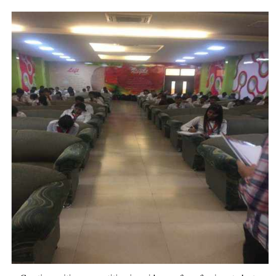
Creative writing competition in guidance of our foreign students