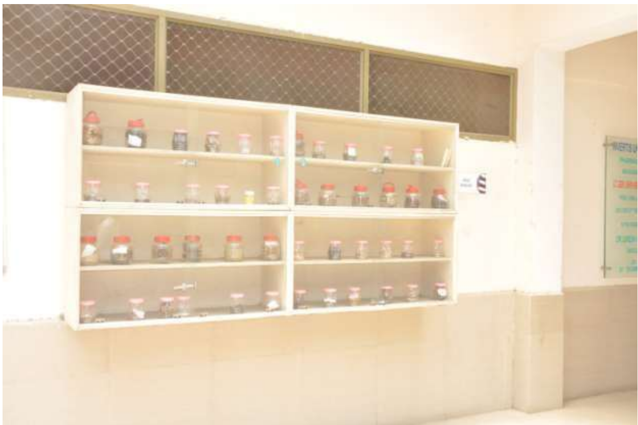
Civil Engineering Lab: