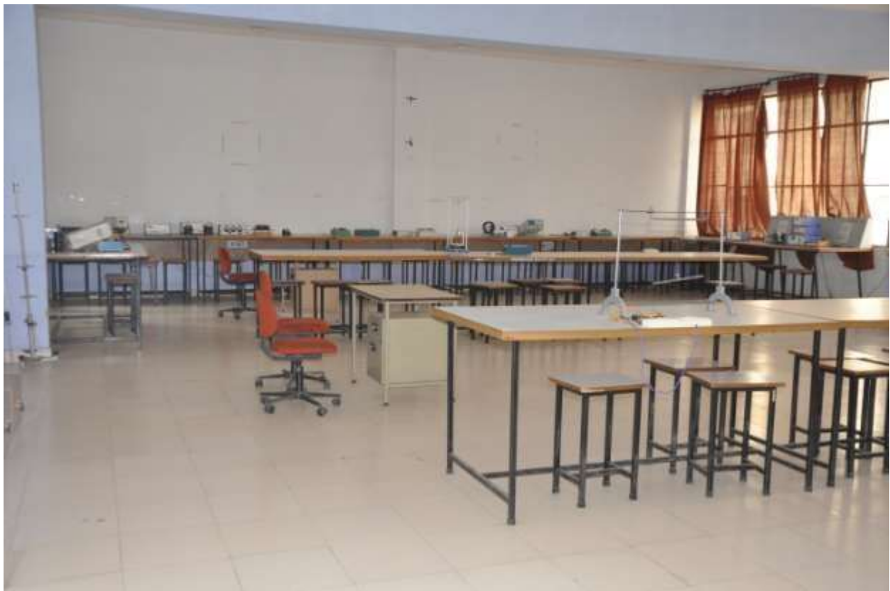
Mechanical Engineering Lab: