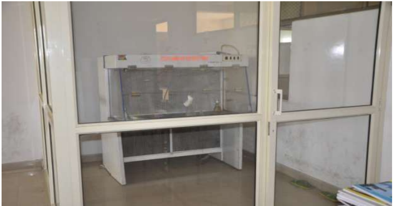
Herbal Drugs Museum: