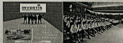
News Coverage: Press Note