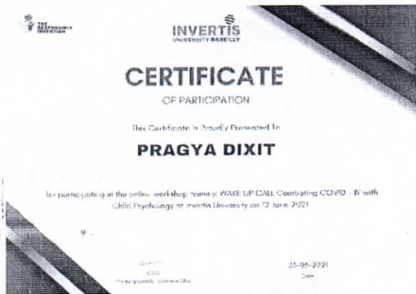
Sample Certificate 12-06-2021