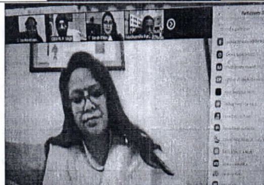
Invited Speaker 12-06-2021