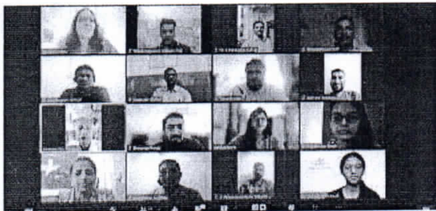
Students and Faculty attending online workshop 12-06-2021