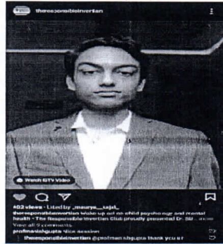
Students hoisting during online event 12-05-2021