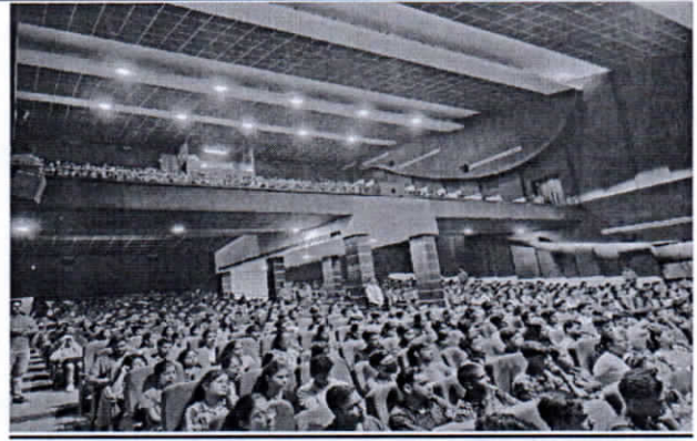
Orientation Session, 20-08-19