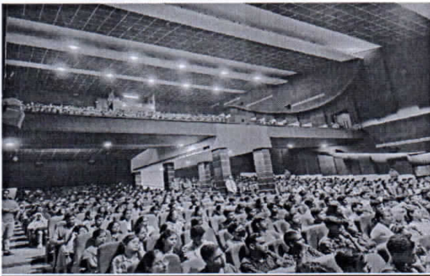
Orientation Session, 20-08-19