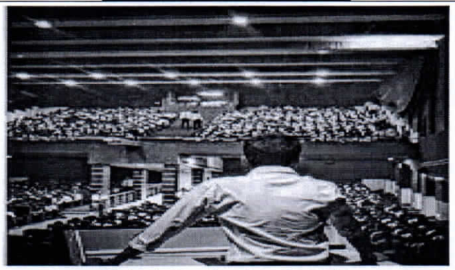
Orientation Session, 20-08-19