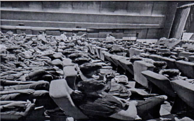
Orientation Session, 20-08-19