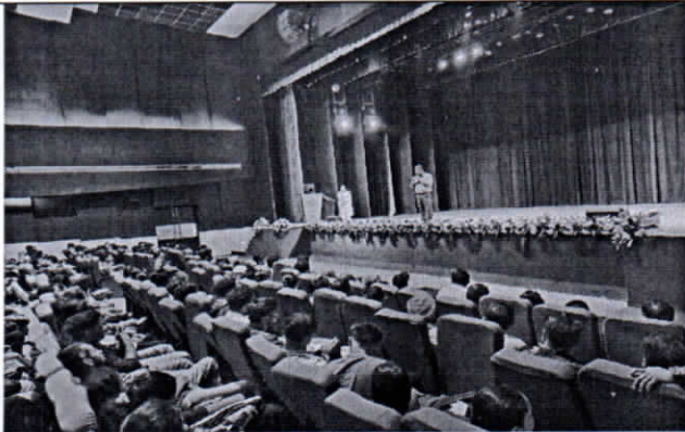
Orientation Session, 20-08-19