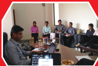
J K Technosoft