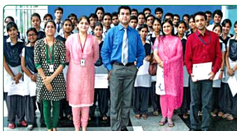
MAHINDRA & MAHINDRA