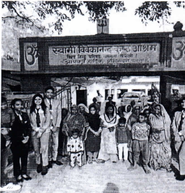
Group photograph with the members of Kushth Ashram 17-12-2018

Witnessing the smiles and gratitude on the faces of those we served reaffirms our belief in the profound happiness and fulfillment that comes from giving back to our community. We believe that this event reflects our club's commitment to social responsibility and showcases our dedication to serving the underprivileged members of society.