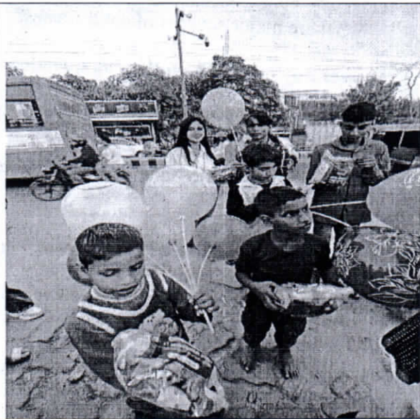
Kidz after getting gifts 13/11/2018