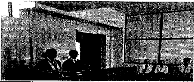
Students in Moot court 09-05-2021

Girls' education is not only a matter of fundamental human rights but also a crucial factor for social and economic development. This legal consultation highlights the importance of enforcing existing laws and policies, raising awareness, and addressing the systemic barriers that hinder girls' access to education. It is a collective responsibility to ensure that all girls have the opportunity to receive a quality education and fulfill their potential.