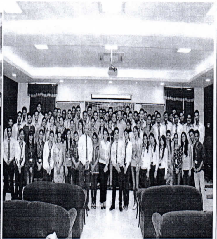
Team RI and students after program 27/09/2018