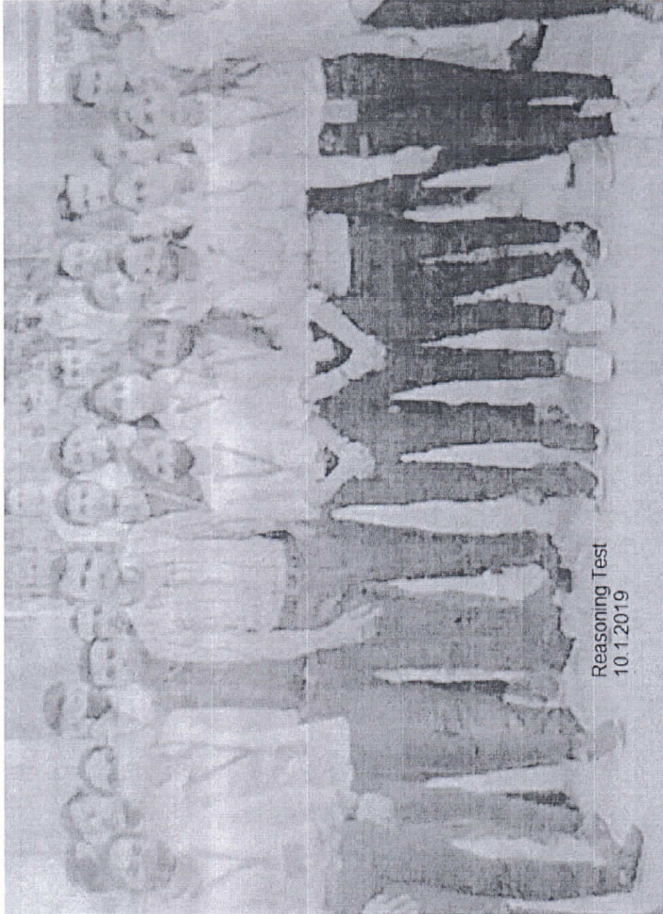
Reasoning Test 10.1.2019