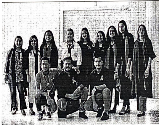
The Nukkad Natak Crew