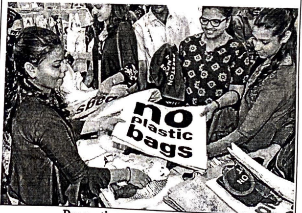
Promoting use of paper bags