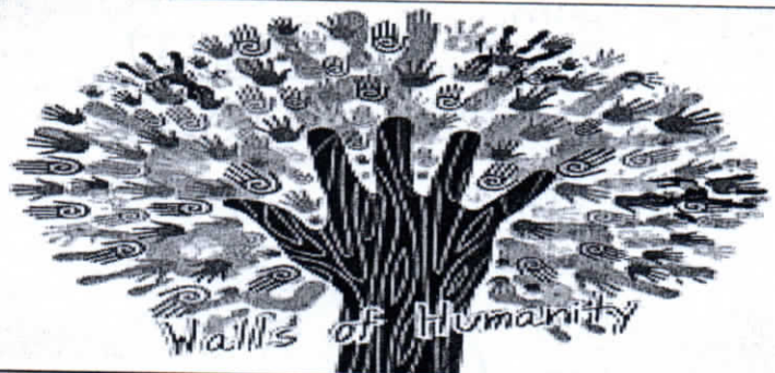
Wall of Humanity Campaign 07-06-2023