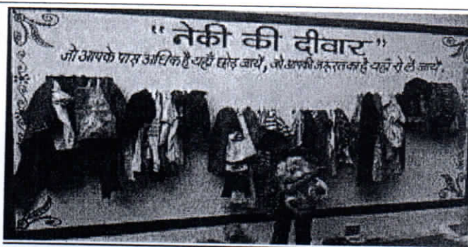
Wall of Humanity Campaign 07-06-2023

The "Wall of Humanity" campaign organized by the Abhiruchi Club was not just an event; it was a testament to the compassion and generosity of the community. It served as a shining example of what can be achieved when people come together to make a positive change. The impact of this campaign will be felt for years to come, reminding us all that small acts of kindness can create a profound ripple effect in our society. In a world where divisiveness often dominates headlines, the Abhiruchi Club's "Wall of Humanity" campaign was a beacon of hope, proving that kindness and unity can triumph over adversity.