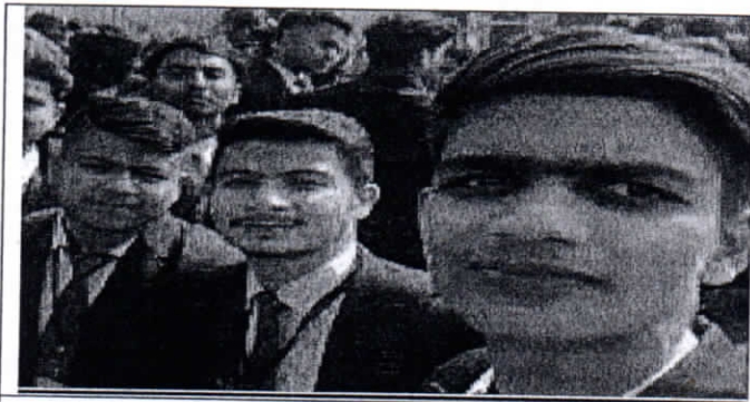
Students in Tabaco free campaign 31-05-2023

The "Tabaco Free Campaign" has made significant strides in promoting a tobacco-free society, with notable reductions in Tabaco consumption and increased awareness of the health risks associated with tobacco use. Continuing efforts, collaboration, and advocacy for stricter regulations are crucial to achieving the ultimate goal of a tobacco-free campaign.