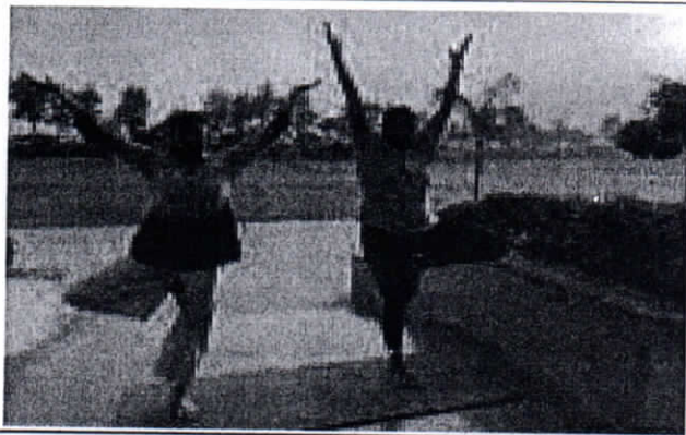
Students in Mental Health Session 10-10-2022