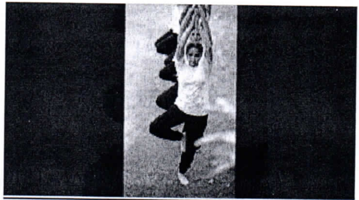
Students in Mental Health Session 10-10-2022