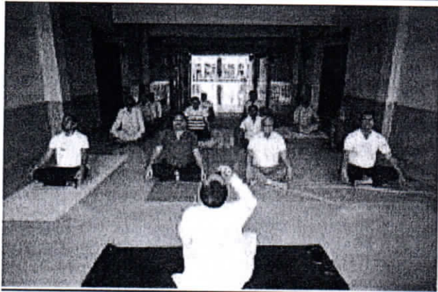
Students in Mental Health Session 10-10-2022