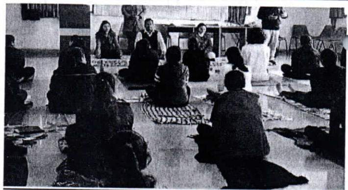
Students in Mental Health Session 10-10-2022