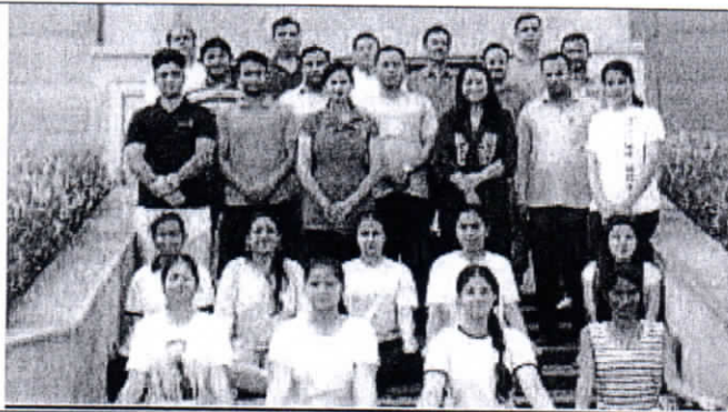
Students in Mental Health Session 10-10-2022