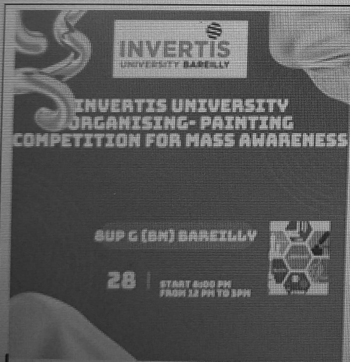
Painting competition for mass communication creative 28/10/2019

Painting competition for mass communication is an innovative and community-oriented initiative. Many individuals and families have benefited from counseling and therapy services provided by the program.