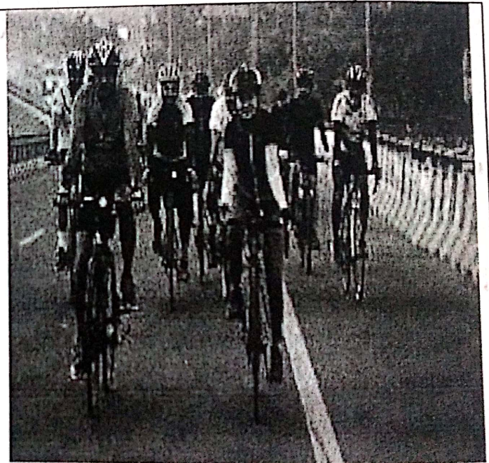
Students participating on 05 July, 2019