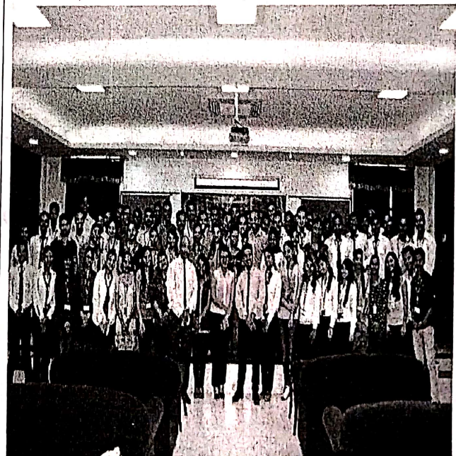
Team RI and students after program 5 June 2020