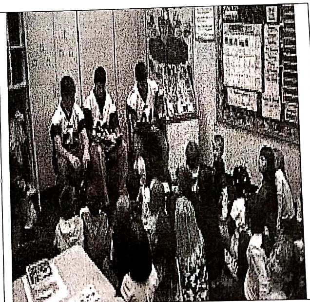
Students participating 26 May 2020