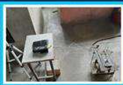
Passive Testing Perform on glass