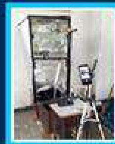
Active Fire testing on Glass using side wall sprinkler