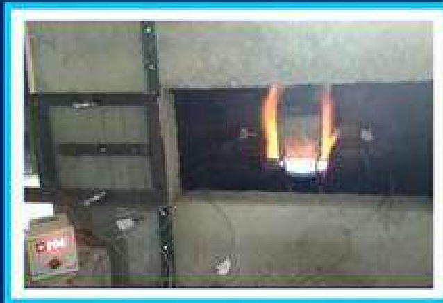
Heat Test in Furnace