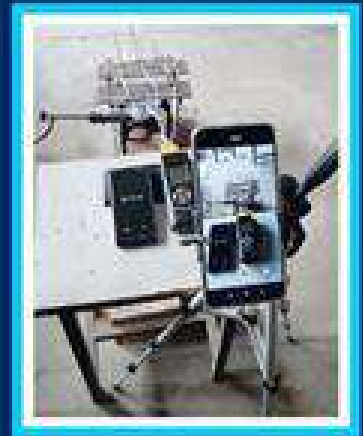
Passive fire testing setup